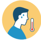
FEVER 100.4* OR CHILLS *or school board policy if threshold is lower

Every morning before you send your child to school please check for signs of illness: