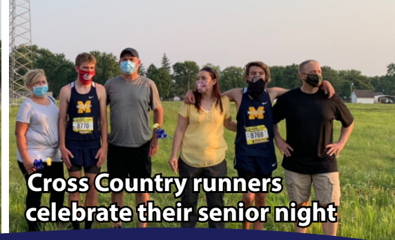
Cross Country runners celebrate their senior night