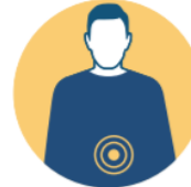
DIARRHEA, NAUSEA OR VOMITING